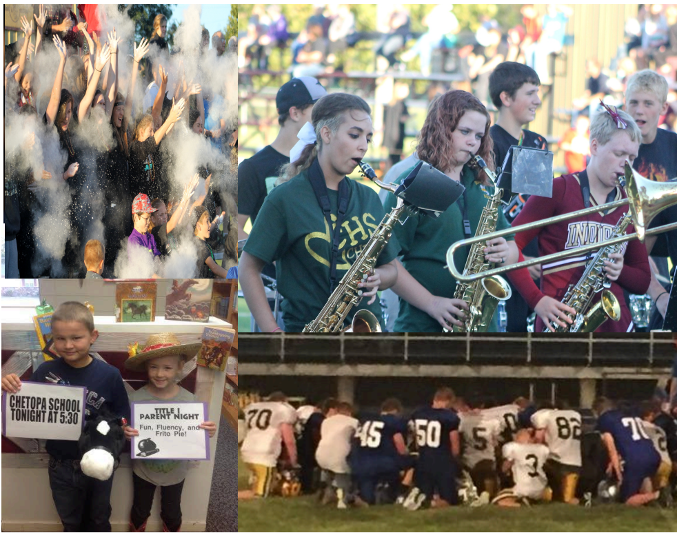
Pictured counter clockwise: St. Paul students show “powder power” during kickoff at high school football; Chetopa Elementary students “rustle up” some enthusiasm for Title I parents’ night; after the Chetopa-Welch JV football game, the two teams came together in prayer; combined Chetopa-St. Paul bands provided pre-game entertainment at the district’s 10-year anniversary